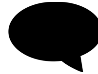
Verbal arguments/ altercation

You can identify and refer cases to the early intervention service (1) based on the presence of ‘early intervention risk markers’ including, but not limited to: