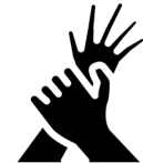
First physical assault