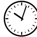
Early signs of controlling behaviours (e.g. isolation from friends/family, made to account for time)