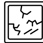
Damage to property