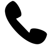
Monitoring (phone checking, questioning children on partner’s activities)